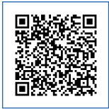
Robotic application SCAN TO WATCH